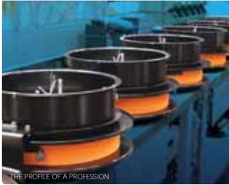
THE PROFILE OF A PROFESSION

The company offers a vast range of products, both standard and engineered ad hoc, to satisfy any kinds of needs. Thanks to its high level of competency,